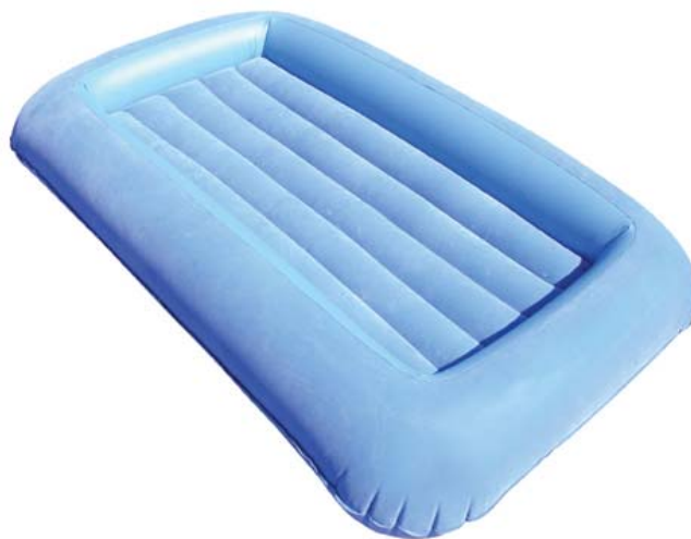
CHILD'S PORTABLE OVERNIGHT BED