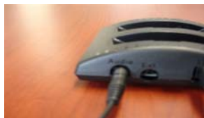
Audio Cord & Transmitter

Plug the Audio cord into the “Audio” jack located on the back of the transmitter. Both of these items came with your TV Ears system.