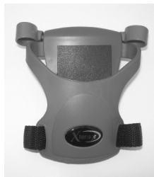
Comfort Pad 1