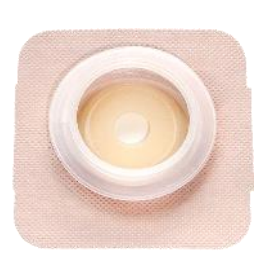
Flange lifts to eliminate pressure when attaching pouch