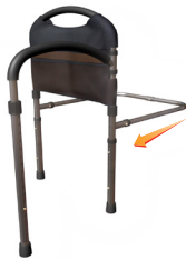
Attach base tubes to main handle