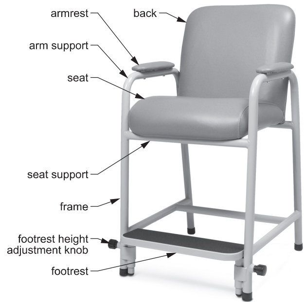
Hip Chair with Adjustable Footrest, Shown Assembled