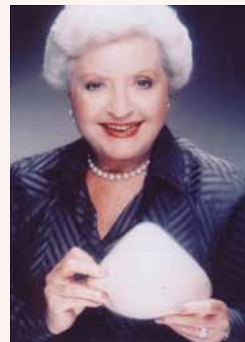
Ruth Handler, creator of the BARBIE® Doll, former CEO of Mattel Corporation, double mastectomee and originator of the NEARLY ME® Brand.

NEARLY ME® breast forms come in several shapes, weights and softnesses to help you match your customer's natural breast as closely as possible. Because of these variations, we have created distinctive form "profiles" in our symmetrical triangle and symmetrical oval forms to help in the fitting process selection. Reference these styles and their recommended profiles when determining a form style for your customer: