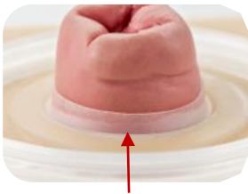
Close-up image of Flex & Form Collar

Patented collar gently clings and shapes around the stoma